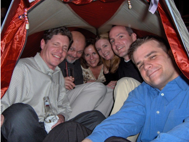
CMCers proving North Face's new Dyad 22 ultralight two-person tent actually holds six.

The CMC/AAC Annual Dinner was held on April 2 nd at the Chicago Yacht Club at Monroe Harbor in Chicago. Eighty-two climbers and guests from the CMC and AAC attended. This is always a great way to welcome the spring and the beginning of the climbing season. Fun was had by all.