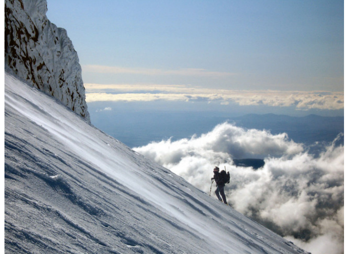
Southside of Mt. Hood, by G.Naxera, on 4/9/2005.

feet of the mountain is very beautiful with interesting snow and crystal formations.